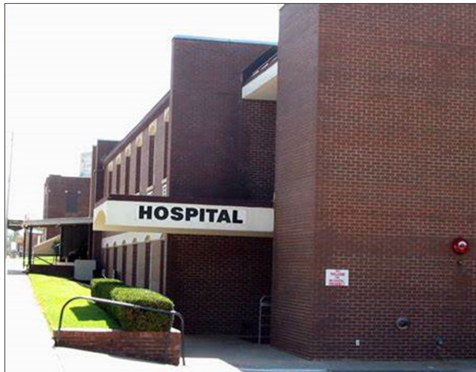
Carnegie Tri-County Municipal Hospital is a 17-bed, licensed critical access hospital located in rural southwest Oklahoma.