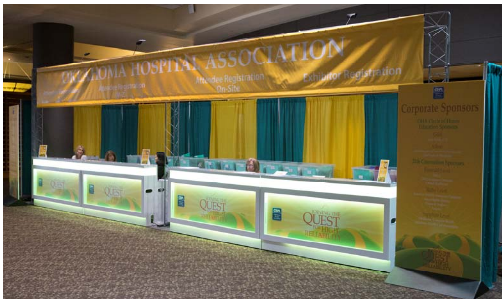
2016 OHA Convention & Trade Show Registration Area